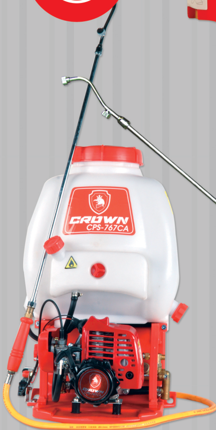
Model : CPS-767CA