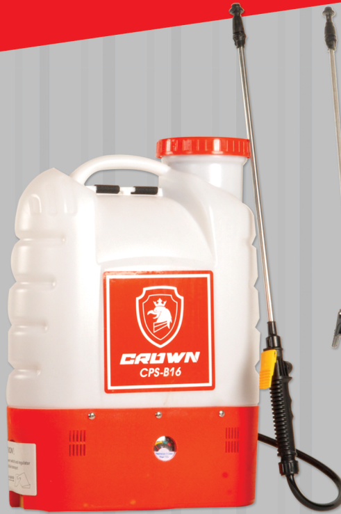
Model : CPS-B16