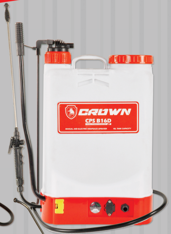
Model : CPS-B16D