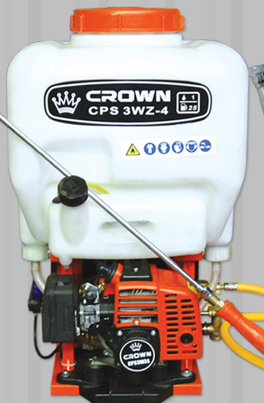
Model : CPS-3WZ4